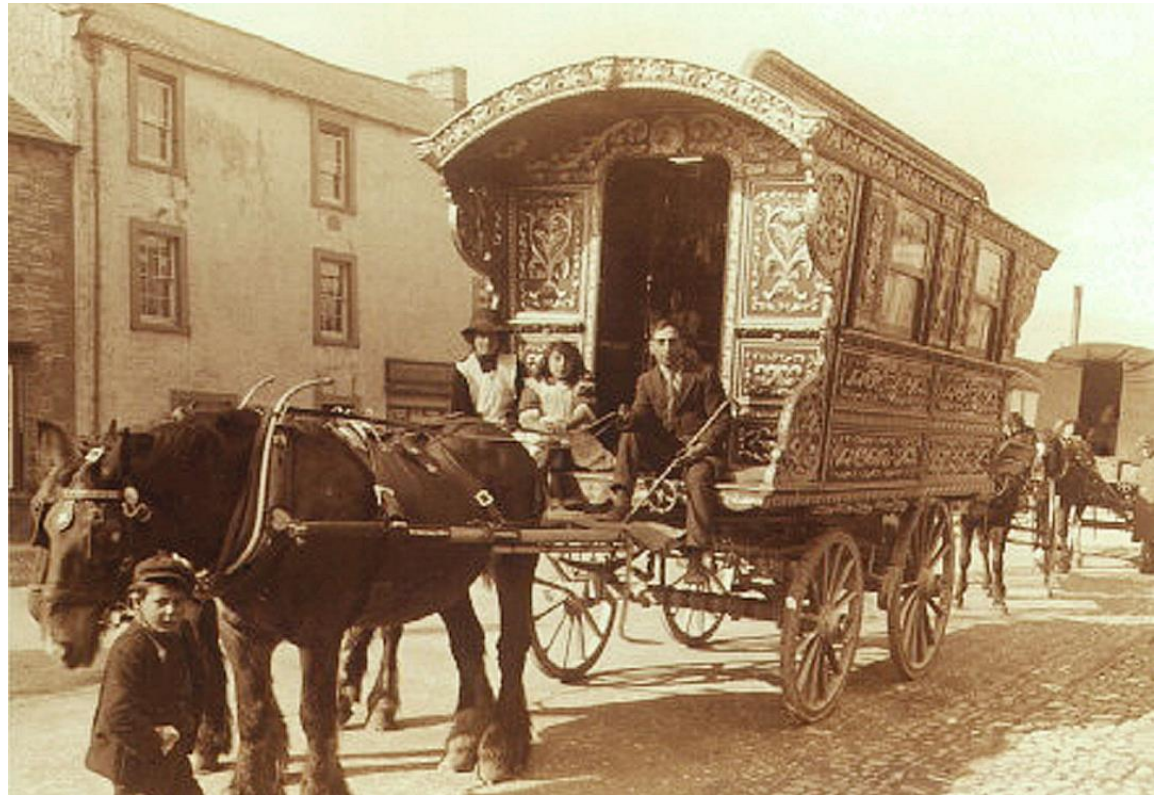
Picture Capture: Historic image of a traveller family, vardo, and horse.