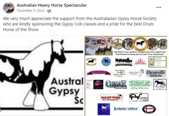
Picture Caption: The Heavy Horse Spectacular - Sponsored by AGHS 2024

Held at the Sydney International Equestrian Centre over two days 17 th - 18 th February 2024, what an amazing venue.