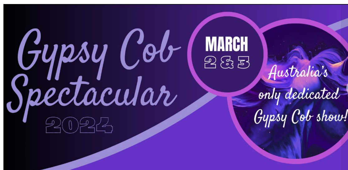
Picture Caption: Brought to you by the All Breeds Show Society Inc. Sponsored by The Australian Gypsy Horse Society