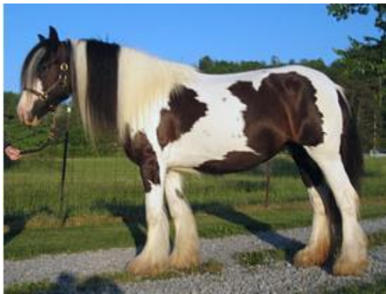
Picture Caption: Other names - Cob; Gypsy Vanner; Gypsy Horse; Irish Cob; Tinker Horse