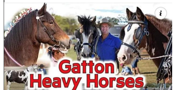
Picture Caption: Gatton Heavy Horse Field Day 2024 Sponsored by AGHS 2024

Sponsoring The Gatton Heavy Horse Field Day again for another year, financially we are thrilled to be behind the Gypsy Cob classes at this event.